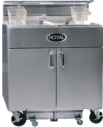
RFT-75-2-EM with optional casters

Models: RFT-75-2-XX RFT-75-3-XX RFT-75-4-XX RFT-75-5-XX