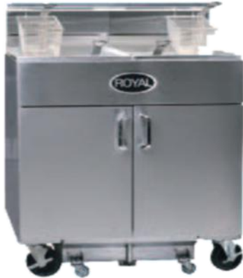
RFT-60-2-EM with optional casters

Models: RFT-60-2-XX RFT-60-3-XX RFT-60-4-XX RFT-60-5-XX