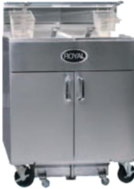
RFT-50-2-EM with optional caster

Models: RFT-50-2-XX RFT-50-3-XX RFT-50-4-XX RFT-50-5-XX