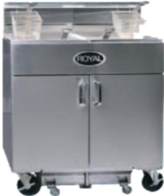
REEF-35-2-EM with optional casters

Models: REEF-35-2-XX REEF-35-3-XX REEF-35-4-XX REEF-35-5-XX