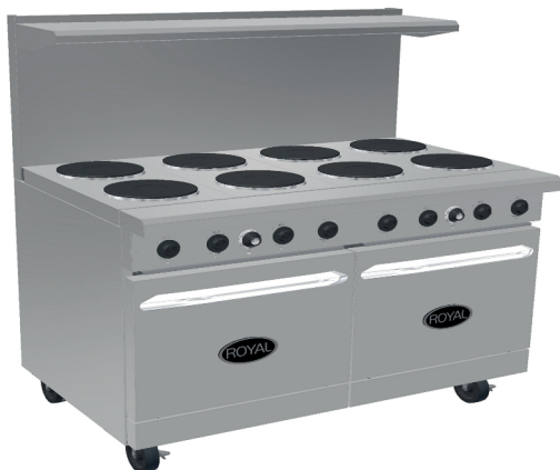
RRE-8 Shown with optional casters

Models: RRE-8 RRE-6GT12 RRE-4GT24 RRE-2GT36 RRE-GT48