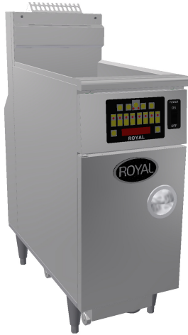
SHOWN WITH COMPUTER CONTROL

Models: RHEF-45EM-1F RHEF-45DM-1F RHEF-45CM-1F