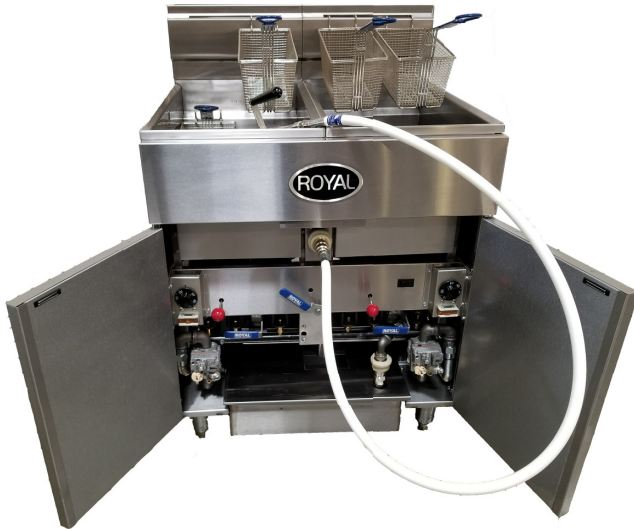
Shown with optional flush hose